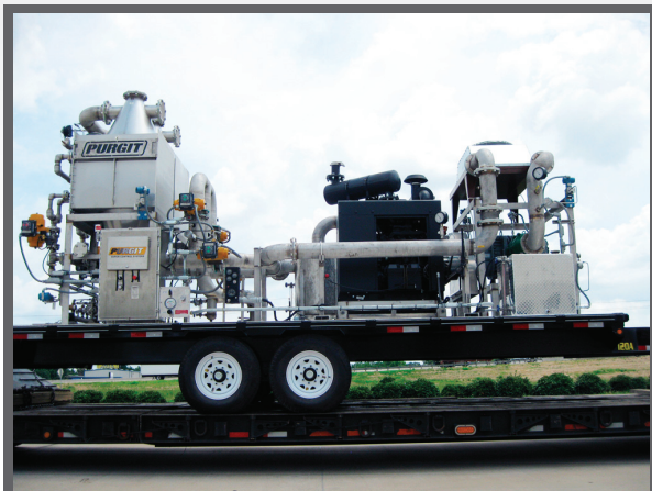
Diesel Powered Portable C-3

PURGIT's mobile refrigerated vapor recovery units are the fastest and safest VOC vapor control systems available. Employing state of the art controls and a simple, patented design PURGIT's C-model vapor recovery units can degas storage tanks and barges without any recordable emissions. Units are available as a service and for purchase or lease in Houston, Texas.